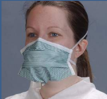
PFL® N95 NIOSH Approved Particulate Respirator Meets Centers for Disease Control (CDC) and World Health Organization (WHO) recommended protection levels where applicable