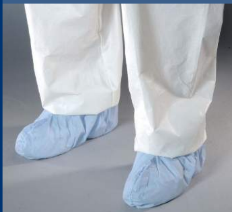
Critical Cover® UltraGrip™ Shoe Covers The Ultimate in Slip and Fall Protection