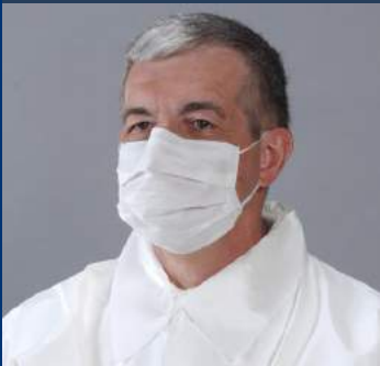
Critical Cover® CoolOne™ Facemasks Hypoallergenic, fluid resistant sensitive skin Facemask

Alpha Pro Tech designs and manufactures a wide range of Facemasks and Face Shields for the Medical, Dental, Laboratory and light industrial marketplaces.