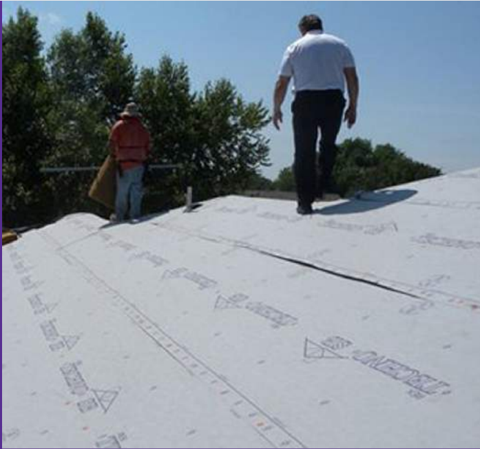
REX TECHNO SB™ Synthetic Roof Underlayment

Alpha Pro Tech is recognized in the industry as a leading manufacturer, innovator and creator of premium synthetic underlayments evidenced by our numerous private label manufacturing agreements outside of our proprietary brands. Products that go unseen, protection that gets noticed - that is what Alpha Pro Tech is recognized for.