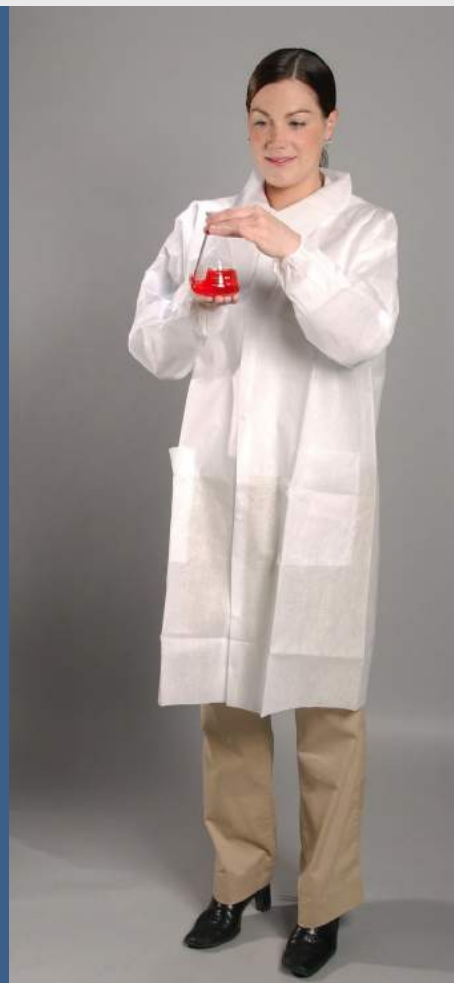
Critical Cover® ComforTech® Lab Coats Keep Wearers Cool, Comfortable and Protected

Head-to-toe protective garments highlight Alpha Pro Tech's limited-use Apparel portfolio. From Pharmaceutical Production to Medical Device to Electronics, we manufacture a variety of configurations and performance characteristics so that our materials exceed the expectations of our customers and the critical environments in which they operate.