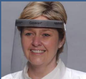
Critical Cover® Clearall® Face Shields Protection against light splash and particles