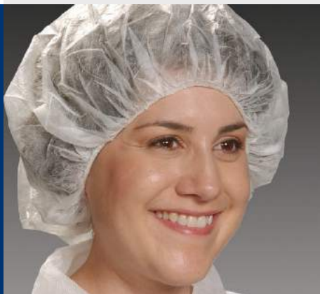
Critical Cover® GenPro® Bouffant Basic Head Protection for Non-Hazardous Environments