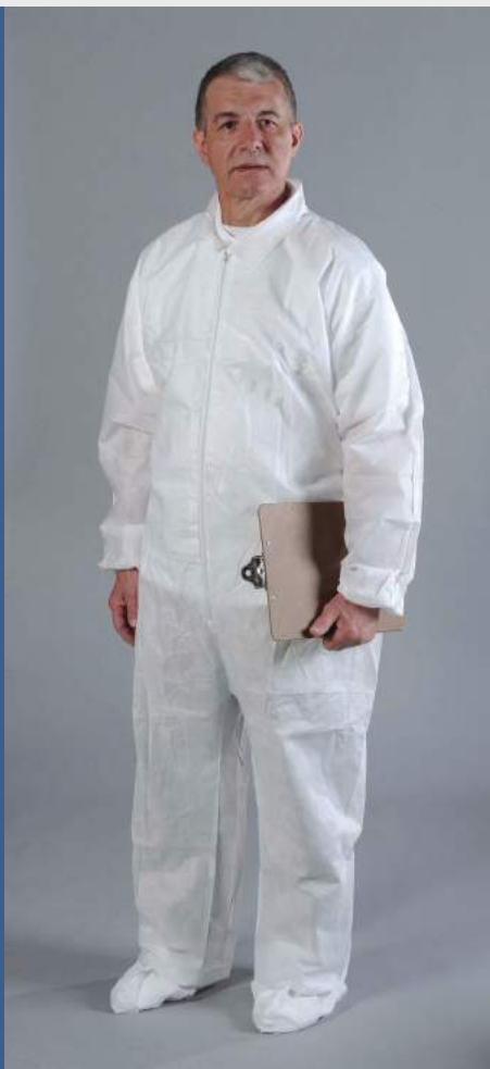
ComforTech™ Coveralls Provide superior protection without sacrificing comfort