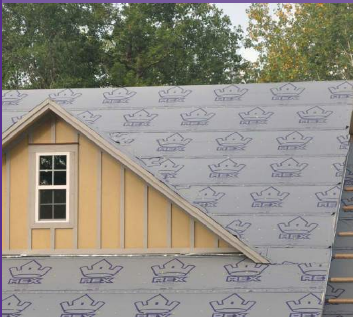
REX™ SynFelt Synthetic Roof Underlayment, our premium brand

Alpha Pro Tech is recognized in the industry as a leading manufacturer, innovator and creator of premium synthetic underlayments evidenced by our numerous private label manufacturing agreements outside of our proprietary brands. Products that go unseen, protection that gets noticed - that is what Alpha Pro Tech is recognized for.