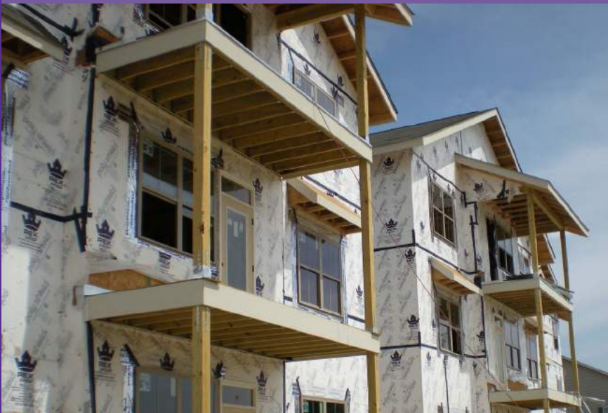
REX™ Wrap Weather Resistive Barrier on a Multi Family dwelling

Along with protecting roofs, Alpha Pro Tech also has a flagship line of weather resistive housewrap barriers for the walls. From the most economical priced point product up to systems that offer newer performance standards in the ever changing building industry, we have you covered.